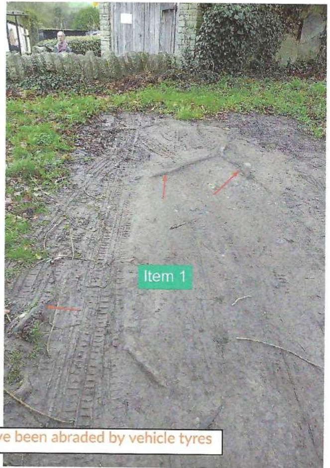
red arrows show roots that have been abraded by vehicle tyres